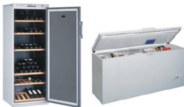
6. ábra. Whirlpool wine cellar and chest freezer 8

Look at the picture. (Figure 6) In the following text 7 you are going to read some technical details about a wine cooler and a chest freezer. The sentences are mixed up. Put them to the right place.