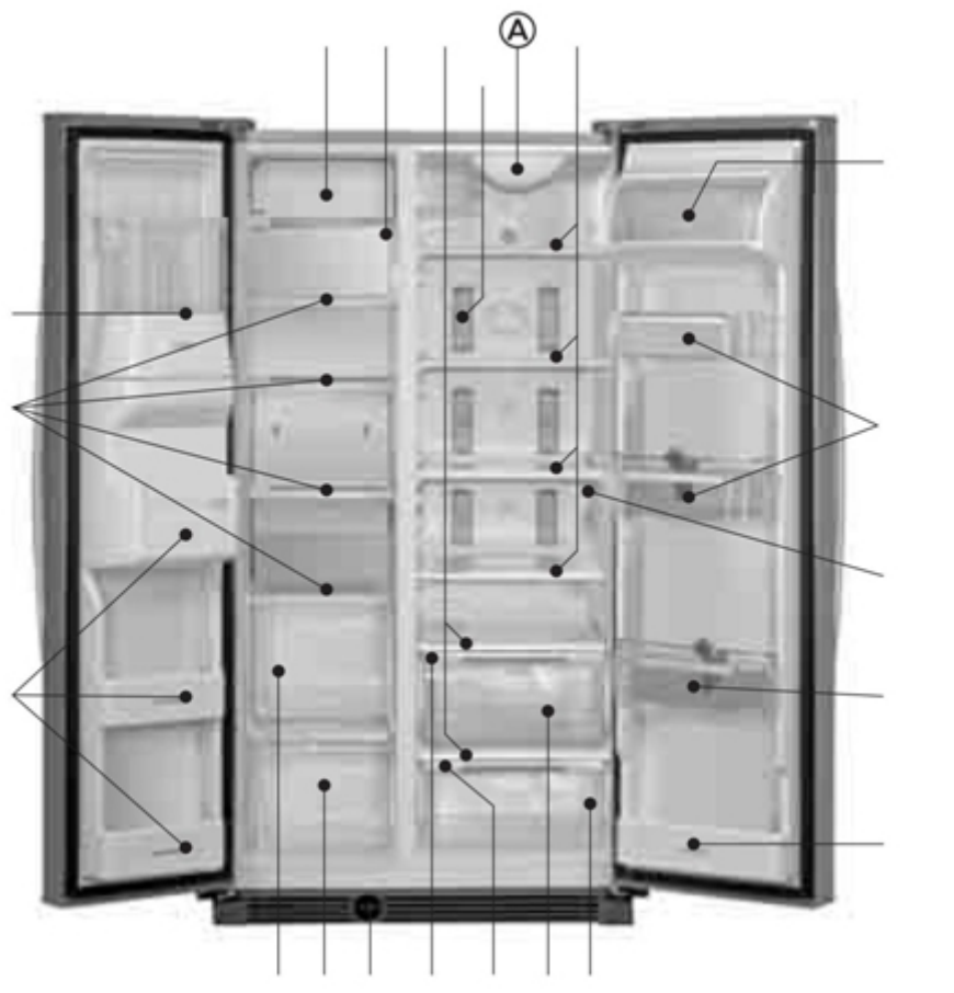
5. ábra. The inside parts of Whirlpool 20RI D4 Espresso 6

Smart keys: 1. The crisper is above the meat/vegetable drawer. 2. The meat/vegetable drawer is at the bottom of the refrigerator compartment. 3. The inside light in the freezer compartment can be found below the automatic ice maker. 4. The lowest part of this appliance is the water filter.