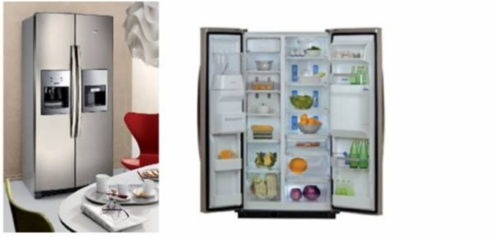
4. ábra. Whirlpool 20RI D4 Espresso side-by-side fridge 5

In the following section you are going to read the shop assistant's recommendation on a new type of side-by-side refrigerator. Look at the picture (Figure 4) and complete the explanation with the appropriate word or expression from the box. The first answer is given.