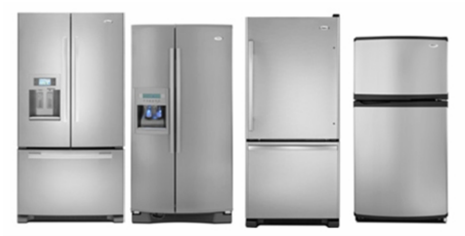
1. ábra. Fridges in different shapes 1

You don't necessarily have to open the entire fresh foods area when you store or retrieve food because the fresh foods compartment is accessible with two side-by-side doors. Some refrigerators are equipped with a vertical panel called "smart seal," that allows the doors to seal tightly, eliminating the problem of the two door seals rubbing together. Refrigerators will have more new design developments in the future because manufacturers strive to create more energy-efficient and feature-rich fridges.