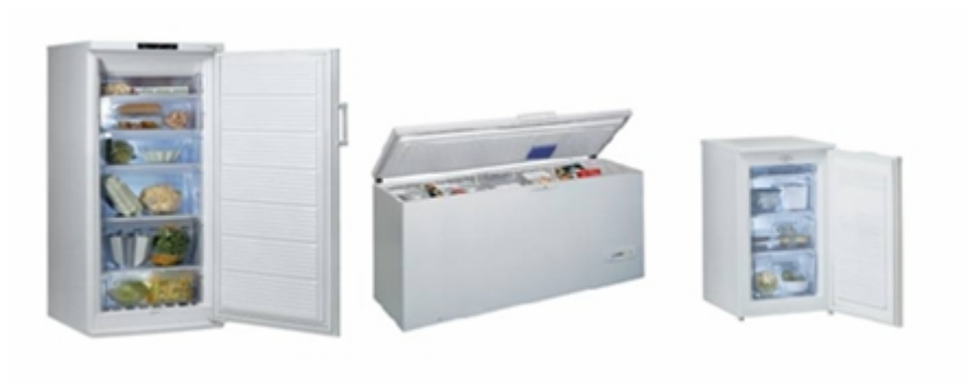
2. ábra. Upright, chest and undercounter freezers 2

Upright freezers allow ease of retrieving, sorting and organizing frozen foods. Some of them come with automatic defrost system, but foods can freezer burn more quickly, and energy costs are a bit higher.