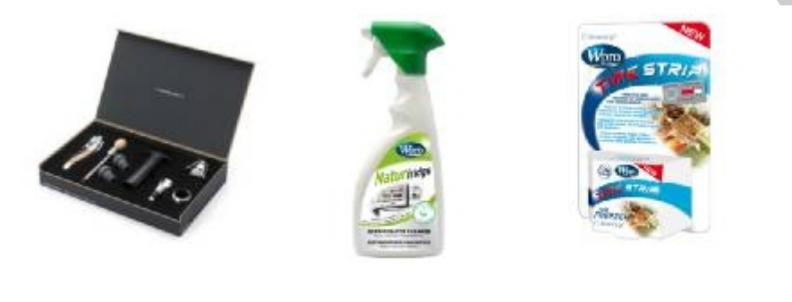
7. ábra. Different accessories for wine cellars, fridge-freezers and freezers 9